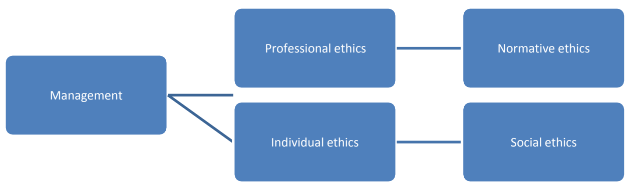
Figure 1 : Board and ethics relation Model.