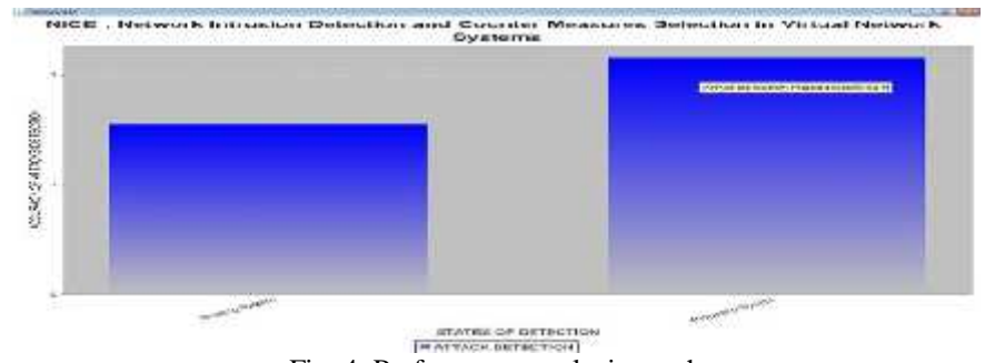
Fig. 4. Performance analysis graph

To determine the viability of our solution, reasonable studies were conducted on several virtualization approaches. Evaluated NICE based on Dom0 and DomU implementations with mirroring-based and proxy based attack detection agents (i.e., NICE-A). In every virtual machine NICE-A is deployed which is connected to the monitor network to handle the traffics in the network using Switched Port Analyzer (SPAN) approach. When the IDS is running in Intrusion Prevention System (IPS) mode, it needs to intercept all the traffic and perform packet checking, which requires more system resources when compared to IDS mode.