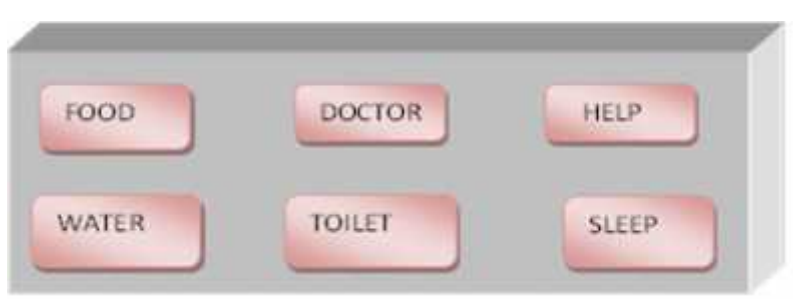
Fig. 3: Included Services to the User

The proposed systeminitially displays a screen which shows six basic needs as shown in figure3. The camera module is placed in front of the computer monitor. The camera unit will continuously input the video stream to the raspberry pi's graphics processing unit (GPU). The graphics processing unit will initially detect the face in the video input and then eye movements are tracked. The camera supplies 15 colour images of size 640 \times 480 per second. To achieve real-time performance, the eye blinks detection algorithm processes only 320 \times 240 pixels in grey level at an average 30 frames per second. It will scan for an eye blink which last for several frames of the video input which shows a selection. Simultaneously the detected eye blink makes selections on the display. If a particular option is selected it shows a confirmation message. If the audio output is required for the selected option the audio unit receives the appropriate command and pre-stored audio is selected and outputs to the speaker. Also the audio unit provides beep sounds for on screen selections as acknowledgement.