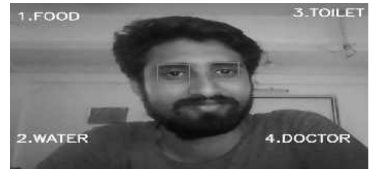
Fig. 4: Eye detection of the User