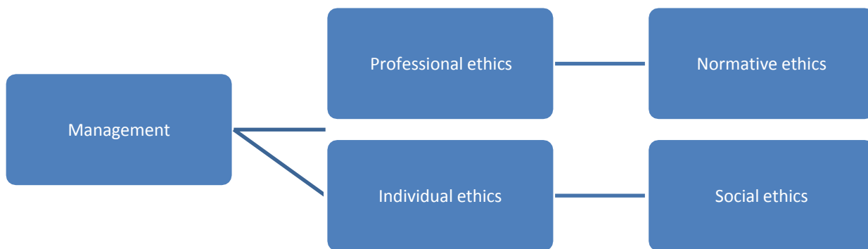
Figure 1: Board and ethics relation Model.