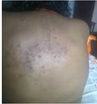
Fig 1: Radiographs of Thoracic Spine Showing Destruction and Lytic Lesion.

Fig 1: Clinical Photo of the Patient Showing Multiple Puckering Lesions over the Skin