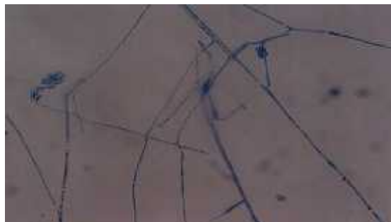
Fig 4: Histopathological examination showed elongated hyphae and spores on methenamine silver and periodic acid-Schiff stains